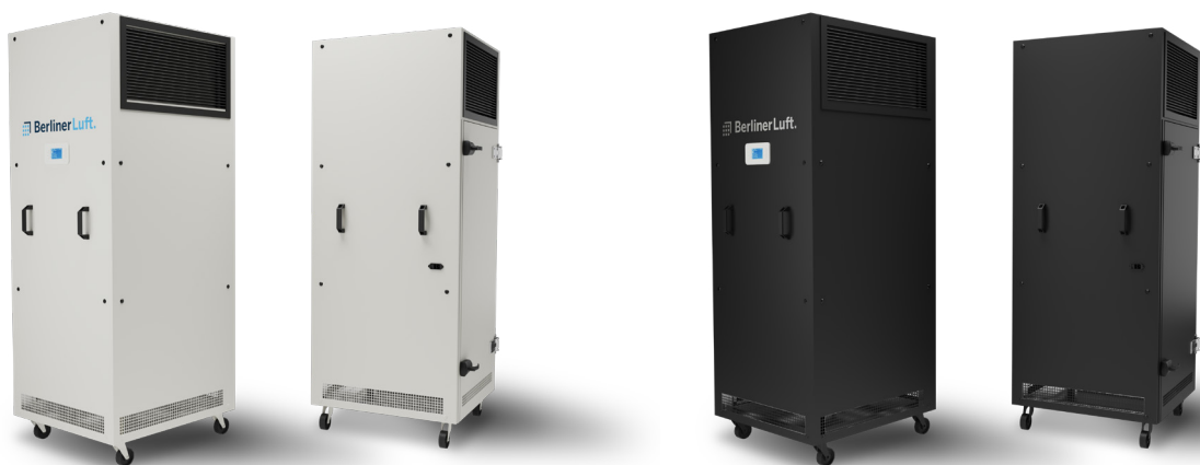
RAL 9016 (light-grey)

As well as the standard colour RAL 7035 (light grey), BerlinerLuft.Pure is also available in other colour options.